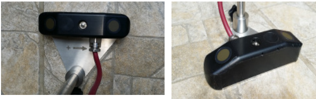
Figure 3: “AquaProfiler sensor