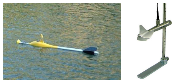
Figure 1: Current meter on the cableway (left side) and on the rod (right side)