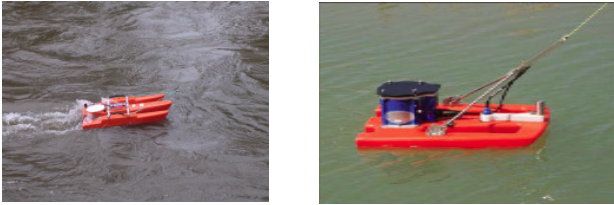
Figure 2: ADCP RDI Rio Grande (left side) and RDI Stream Pro (right side)