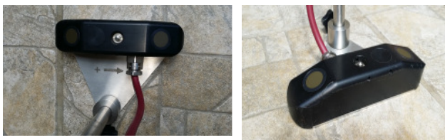
Figure 3: “AquaProfiler” sensor