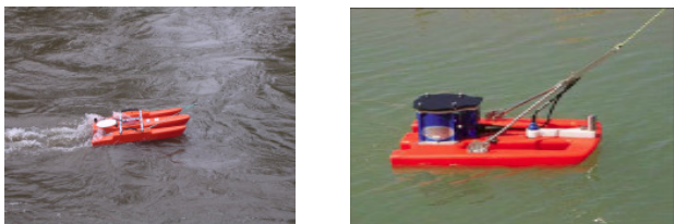
Figure 2: ADCP RDI Rio Grande (left side) and RDI Stream Pro (right side)